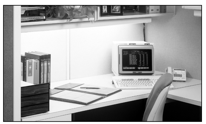
Attractive, unobtrusive lighting